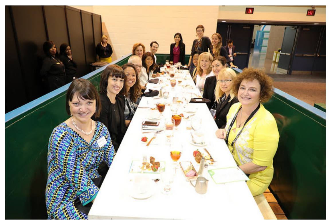
WasteExpo attendees enjoy a "Zero Waste Lunch" in a dumpster equipped with salvaged wood seats and flooring, and table made from rescued doors.