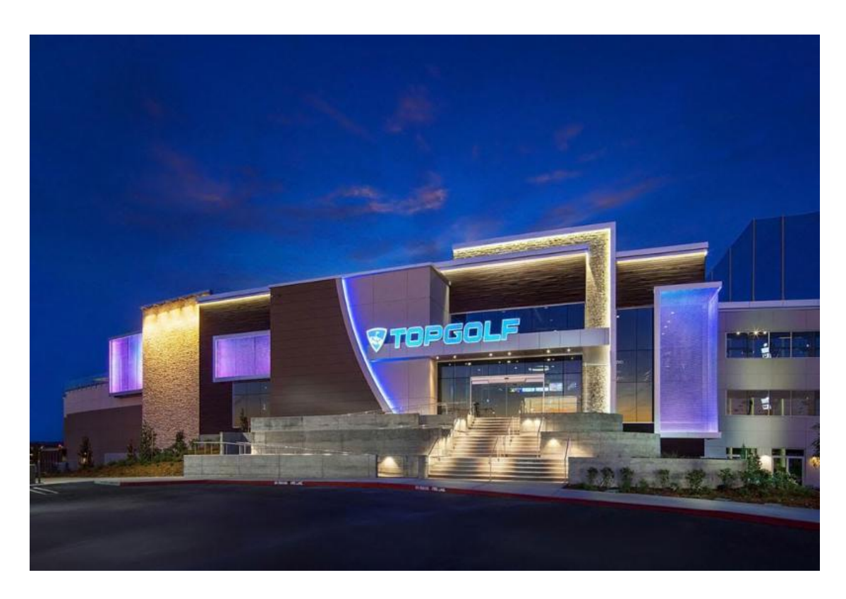
Birmingham - The Birmingham Jefferson Convention Complex will soon have a Topgolf facility as part of its Uptown Entertainment District.

Topgolf International Inc., a best-in- class entertainment venue, complete with dynamic event spaces and food and drink options rivaling any sports bar, is building its first Alabama location on property owned by the BJCC in the Uptown Entertainment District. It is expected to be completed by the end of 2017.