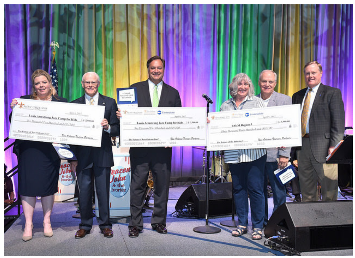
New Orleans Tourism Industry Officials Present Donation Checks to The Louis Armstrong Jazz Camp for Kids at Global Meetings Industry Day.

Lead by the industry advocacy coalition Meetings Mean Business (MMB), GMID 2017 showcases the real impact that business meetings, conferences, conventions, incentive travel, trade shows and exhibitions have on people, business and communities. MMB joins forces with the Convention Industry Council (CIC), U.S. Travel Association, Meeting Professionals International (MPI), Professional Convention Management Association (PCMA), International Association of Exhibitions and Events (IAEE), Society for Incentive Travel Excellence(SITE), COCAL and other groups. In one united voice they will advocate for the industry, showing that meetings make a difference no matter the location.