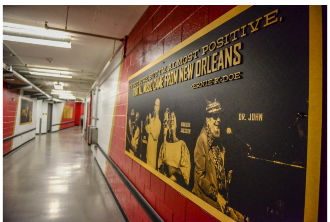
"I'm not sure, but I'm almost positive, that all music came from New Orleans" - Ernie K-Doe