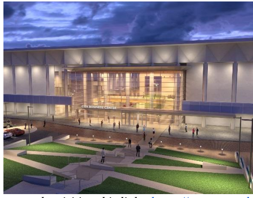
Experience a fly-thru of the new spaces by visiting this link - <a href="https://www.youtube.com/watch?v=EP9ONwuXABg">https://www.youtube.com/watch?v=EP9ONwuXABg</a>

Cox Business Convention Center (CBCC) was all about change in 2020 when the venue launched its new brand, name change, and web redesign in early February. CBCC will be adding to its new look with a grand re-opening of the venue's east side in early August. CBCC has created a true "front door" with a re-imagined South Plaza with valet and rideshare drop-off, and a three-story glass atrium leading into over 4,000 square foot of natural light filled pre-function space. Guests may reach the updated LEGACY Hall (formerly Assembly Hall) and two-levels of meeting rooms by stairs, elevator, or escalator. Grand Hall (formerly a 9,000 seat arena) is a divisible multi-use event space (Oklahoma's largest) and offers over 41,000 square foot with a waving wood detailed 36" ceiling and a three-story glass corner window looking out on downtown Tulsa.