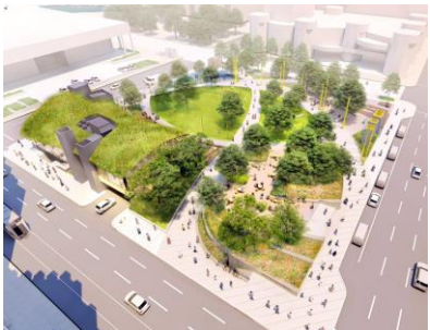
Architect’s rendering of proposed plan for Lynn Wyatt Square for the Performing Arts.