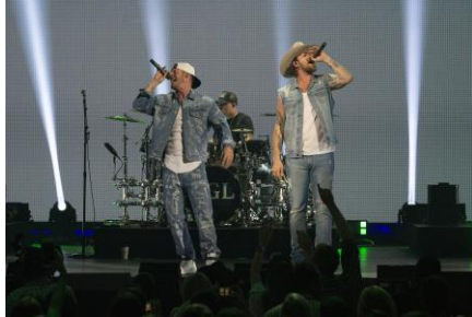
Florida Georgia Line take the stage during the 2019 iHeartCountry Festival presented by Capital One at the Frank Erwin Center on May 4.