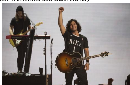
Dan Smyers of Dan + Shay smiles during the 2019 iHeartCountry Festival presented by Capital One at the Frank Erwin Center on May 4.