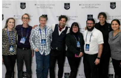
Above: Some of the College Park Center staff with brothers Joel and Luke of for KING & COUNTRY

Grammy award-winning Christian band for KING & COUNTRY played a sold-out concert at College Park Center in Arlington, Texas on November 15. The burn the ships World Tour marked the fourth time the band has performed on the College Park Center stage. This time, however, the stage was transformed to resemble the bow of a ship. The new concept was designed to bring fans into the action like never before.