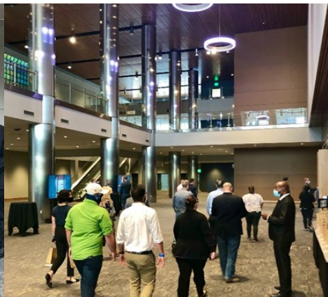
The newly renovated Grand Gallery as guests enter for the Ribbon Cutting Ceremony