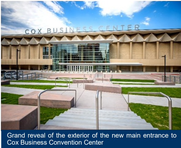
Grand reveal of the exterior of the new main entrance to Cox Business Convention Center