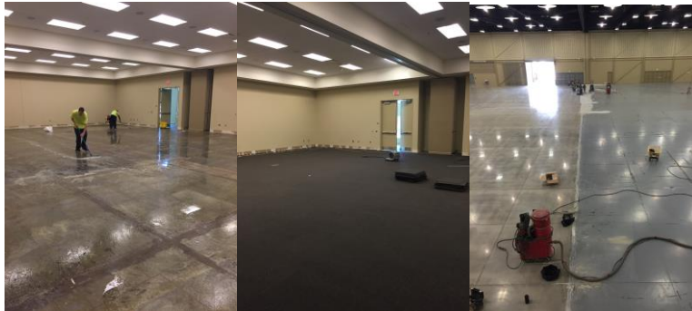
Left to Right: Hall floor before, Hall floor after, Exhibit Hall flooring work in progress

Cox Business Center Tulsa has undergone a total floor refinishing in its 102,000 square foot Exhibit Hall and taken concrete floors from a matte protective epoxy to a polished, low sheen, original finish. The floor has a 400 grit texture sealed with a double coat of densifier; offering an easy to maintain finish that will last at least 15 years without additional finishing. The West Ballroom Meeting Rooms are being renovated with high grade commercial carpet. A unique feature of the project is using permanent tiles along the perimeter and removable carpet tiles in the center to preserve carpet when the rooms are used by Savor (for plating and bussing) during large ballroom events. The project was planned around summer events and will be completed at the end of August; giving fall clients a fresh, new look.