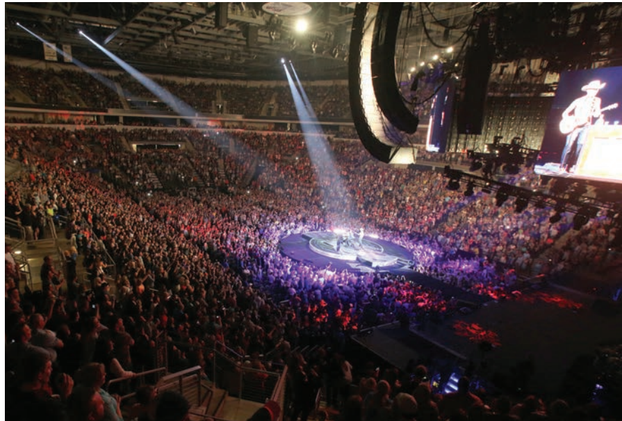
▲ Luke Bryan performs to a sell out crowd at the Denny Sanford PREMIER Center

St. Charles Convention Center ateel@scmocc.com | 636-669-3016