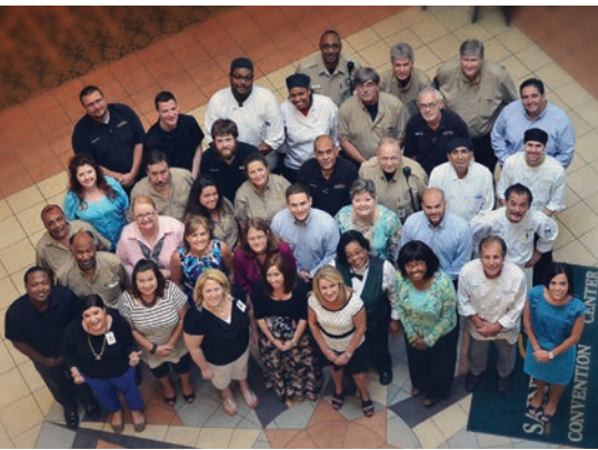
▲ Saint Charles Convention Center staff

The St. Charles Convention Center features a high-quality customer service program to create a service-centered culture that simultaneously rewards facility employees for a job well done on a monthly, yearly, and quarterly basis. In addition to competitive benefits and a positive, team-oriented work environment, professional development and community involvement is encouraged and embraced by the facility.